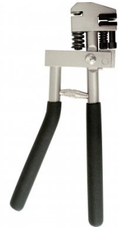
S200 Joggler & Punch Plier