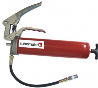
G072 Grease Gun