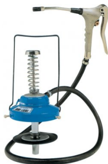
G060 Grease Gun