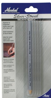
W104B Silver Streak - Welders Pencil