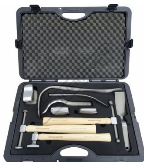
H887 Auto Panel Restoration Kit - Master