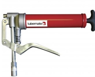
G070 Grease Gun