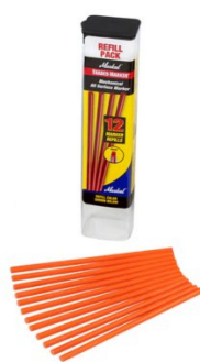
W104A Orange Trades Marker Refills - All Purpose