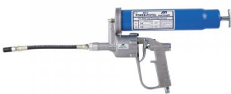
G066 Air Operated Power Pistol - Grease Gun