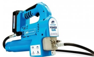
G067 Lithium-ion Battery Operated - Grease Gun