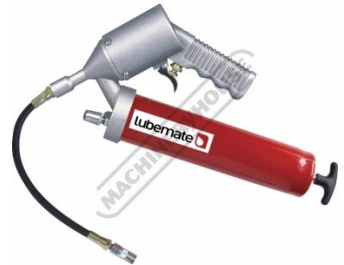
G074 Air Operated Grease Gun