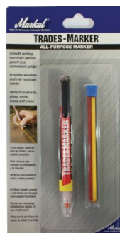
W104 Trades Marker - All Purpose