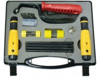
D065 Universal Deburring Tool Set - 23 Piece