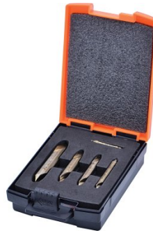
D508 HSS Industrial Centre Drill Set – 5Pcs