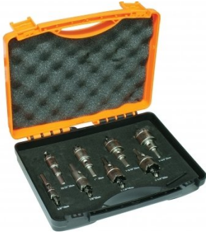
D108 Metric Carbide Tipped Hole Saw Set