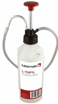
G076 Top Up Pump