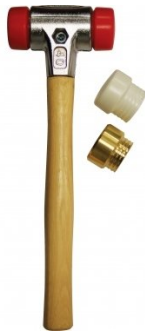
H870 Soft Face Hammer