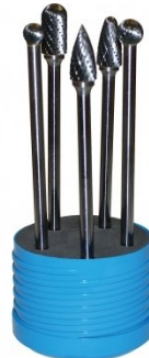
B905 Carbide Burr Double Cut Set - Long Series