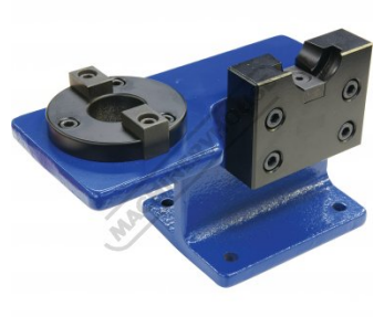
Right Top View