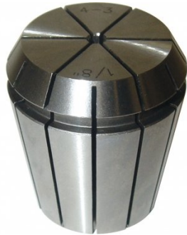
C934 ER40 Collet