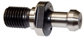
T142 Pull Stud