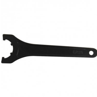
C861 ER25 Collet Chuck Wrench