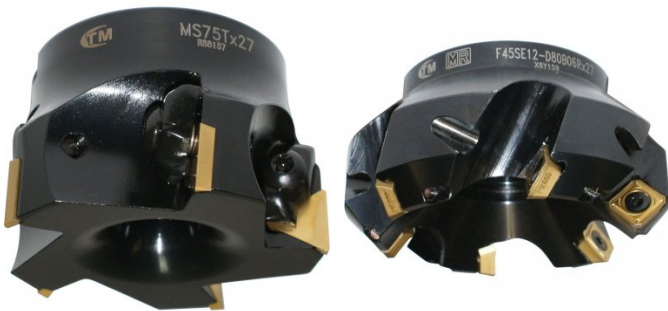
M517 Face Mill 45° - Super High-Rake