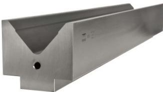
S99244 Dieblock Heavy Duty, Single V 100mm 86 Degrees