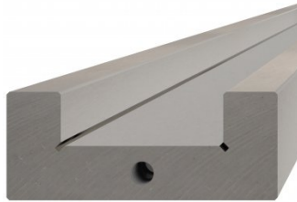
S997B 60mm Die Rail Pressbrake Tooling