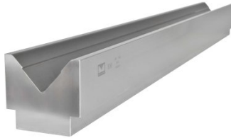
S99240 Dieblock Heavy Duty, Single V 63mm 86 Degrees