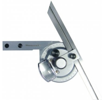
Q201 Universal Bevel Protractor