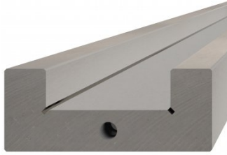
S996B 60mm Die Rail Pressbrake Tooling