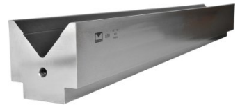
S99242 Dieblock Heavy Duty, Single V 80mm 86 Degrees