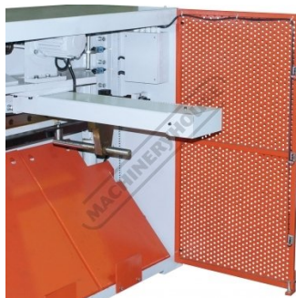
3 Safety Photo Sensors