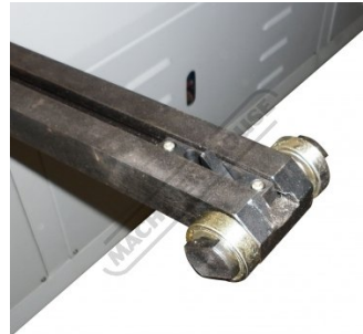
Front Sheet Supports with Roller Bearings