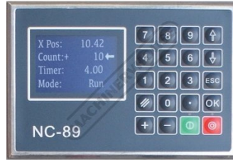
NC 89 Backgauge DRO