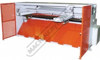
NC-89 Control Backgauge