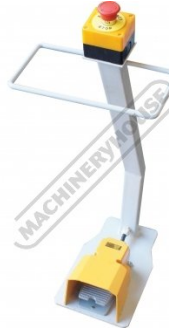
Mobile Foot Control