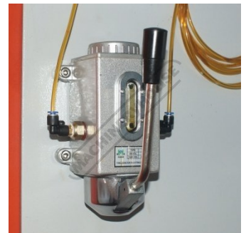
One Shot Lubrication