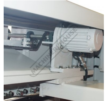
Back Gauge Drive Motor