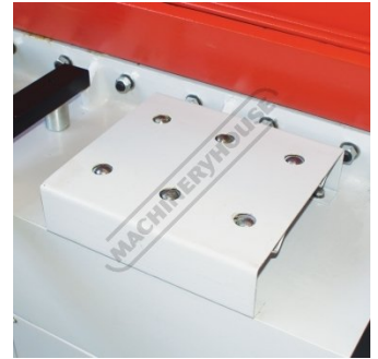
Material Transfer Ball On the Table