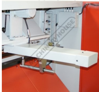
Motorised Backgauge Close Up