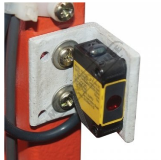
Safety Omron E3ZS Rear Light Sensor Guarding