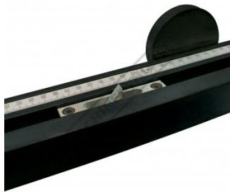
Squaring Arm with Flip Over Stop