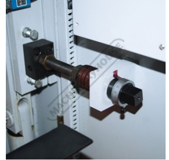
Quick Action Blade Clearance Adjustment