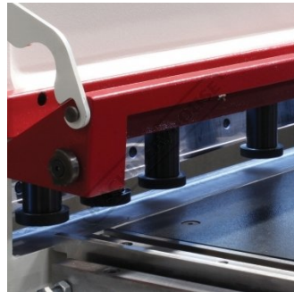
Individual Hold Downs