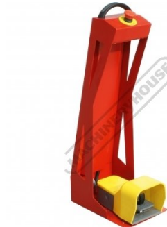
Roving Foot Control