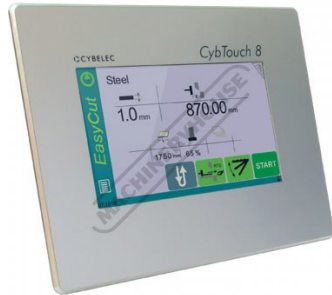
Cybelelec Cybtouch 8W Control Unit