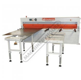
Shown with Optional Ball Transfer Tables - Order Code (L840)