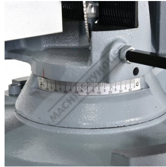
Swivel Head Degree Scale NEW