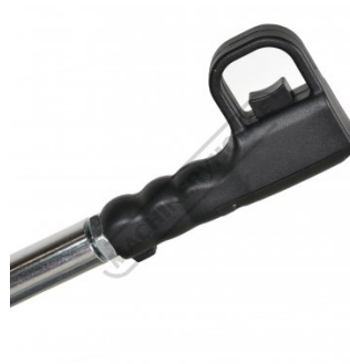
Deadman Trigger Switch