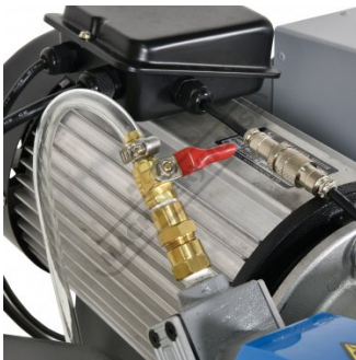
Collant Flow Control Valve