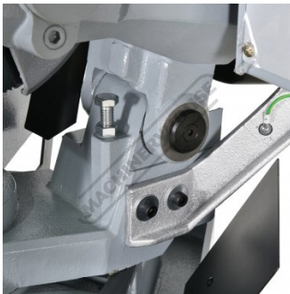
Heavy Duty head Pivot Hinge