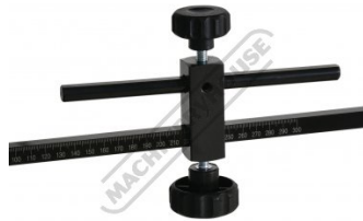
Adjustable Cut Length Stop