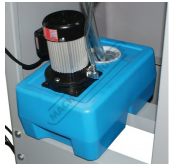
Coolant Pump and Tank