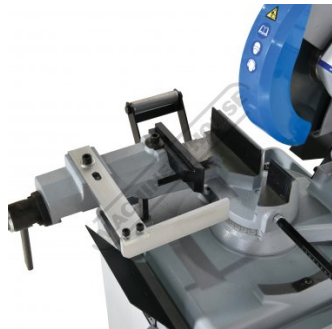
Adjustable Vice Jaws