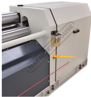
Head Rear View