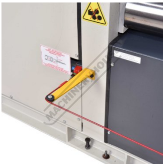
Safety Wire Interlock System