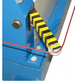
Safety Wire Interlock System