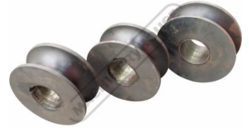
Includes 50mm Pipe Dies