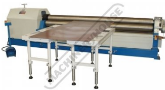
Shown with Optional Ball Transfer Tables