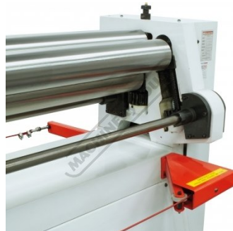
Rear View Rolls Right Side