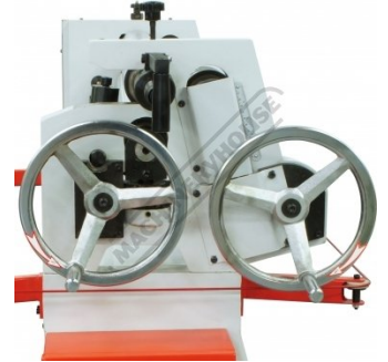
Roll Adjustment Handles