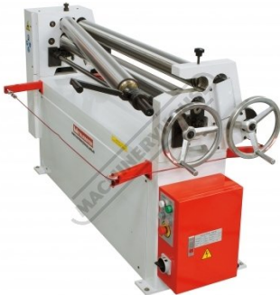
Removeable Top Roller