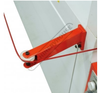
Safety Wire Interlock System