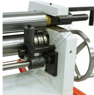
Conical Bending Guide Roller