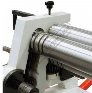
Wire Groove Rolls