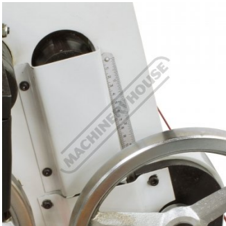
Curving Roller Height Adjustment