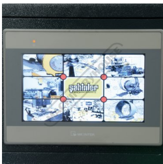
NC Control SAHINLER Screen