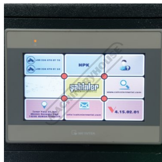
NC Control HPK Information Screen