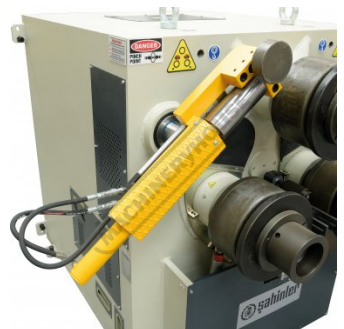
2-Axis Hydraulic Left Lateral Angle Guide Rollers