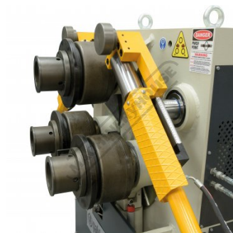
2-Axis Hydraulic Right Lateral Angle Guide Rollers