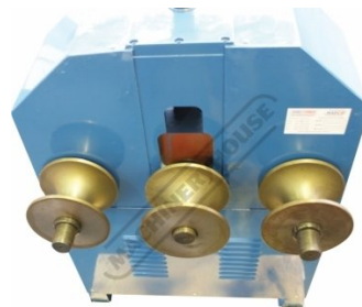
Large Tube Bending Rolls