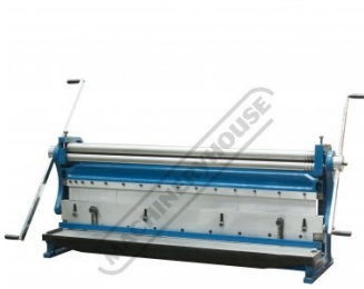
Rolls Full View