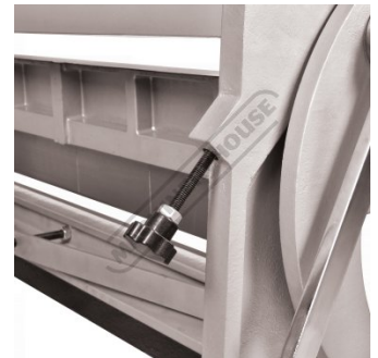
Rear Curving Roll Adjustment