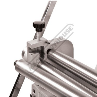
Quick Release Top Roller