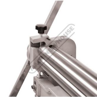
Roll Housing Lock