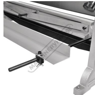
Adjustable Rear Gauge