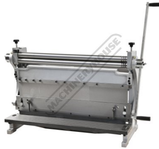
Curving Rolls Full View