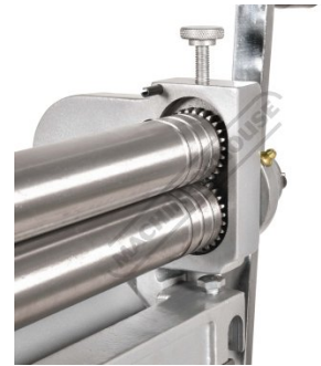
Geared Roll Drive