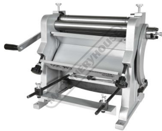
Rear View Rolls Showing