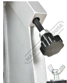
Rear Curving Roll Adjustment Handle