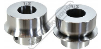
1/2" Die Set