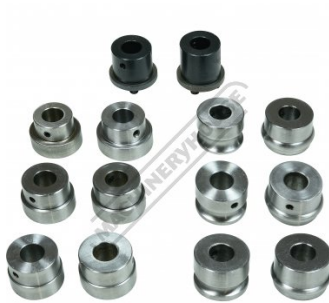
Includes 7 Sets of Rolls