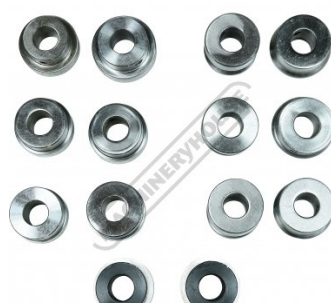
Rolls Sets Rear View