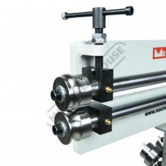
Shown With 1/2" (12.7mm) Beading Rolls