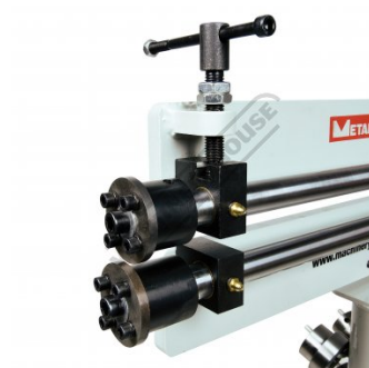
Shown with Shearing Dies