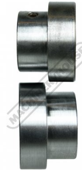
1/4 Inch (6.35mm) Flange Rolls