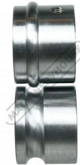
1/4 Inch (6.35mm) Beading Rolls