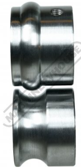
1/2 Inch (12.7mm) Beading Rolls