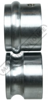
3/8 Inch (9.5mm) Beading Rolls