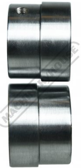
1/16 Inch (1.6mm) Flange Rolls