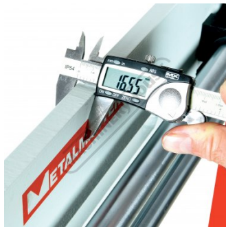
16mm Plate Steel