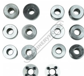
Roll Sets Top View