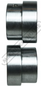
1/8 Inch (3mm) Flange Rolls