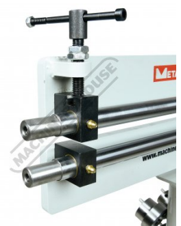
22mm Spigot for Mounting Rollers