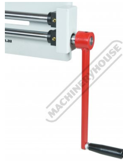
Manual Crank Handle