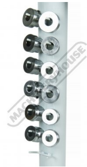
Rolls Stored on Stand