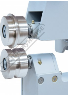
Shown on Machine