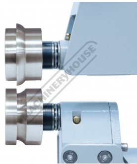
Shown on Machine Side View