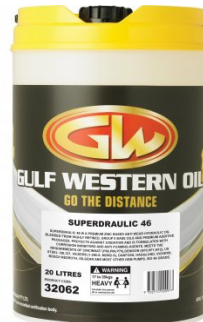
O004 Superdraulic ISO 46 Hi Temp Hydraulic Oil