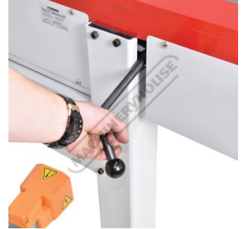
Material Clamp Lever