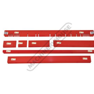
Included Material Clamp Bars