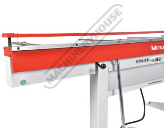
Material Clamp Up