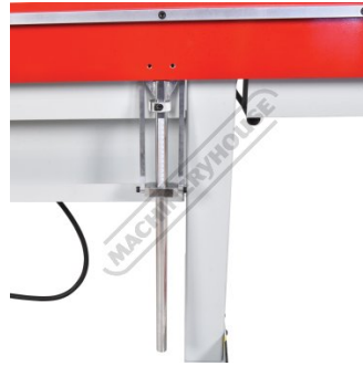
Bend Angle Guide