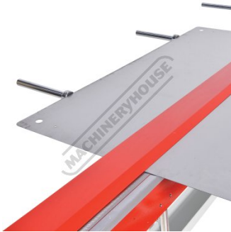
Material Length Stop