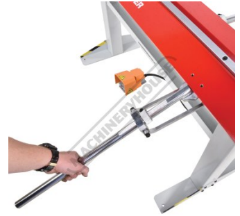
Bend Angle Guide Stop