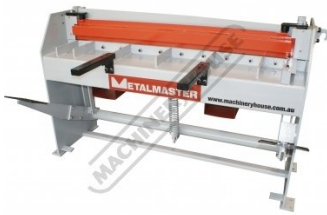
Right Top View