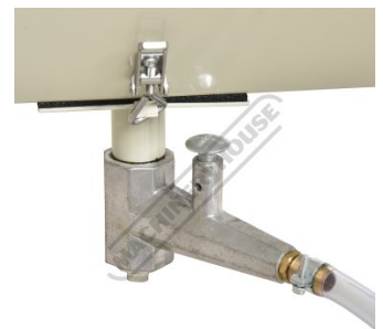
Abrasive Metering Valve