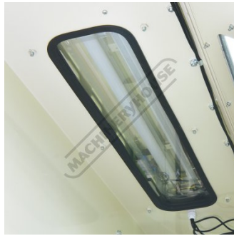
Internal Light with Tear Off Film on Glass