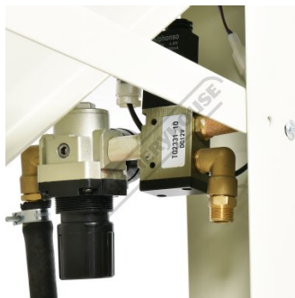
Compressed Air Inlet Connection