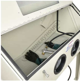
Hopper with Removable Grates