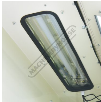
Internal Light with Tear Off Film on Glass