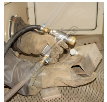
Industrial Duty Blast Gun