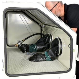
Gloves and Gun Action Shot