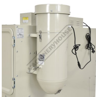
Dust Collector and Filter System