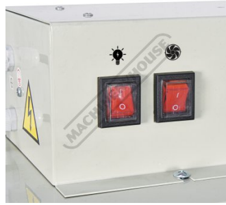
Switches for Light and Dust Collector