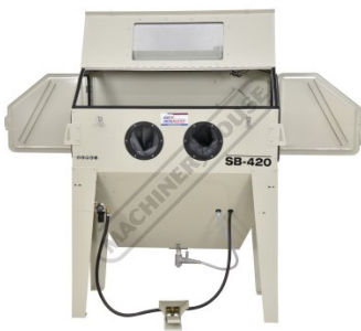
Front View All Doors Open