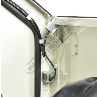
Top and Side Door Safety Interlocks