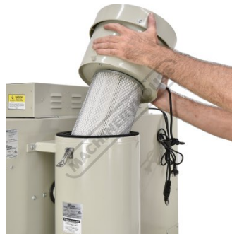
Motor Filter Assembly Being Removed