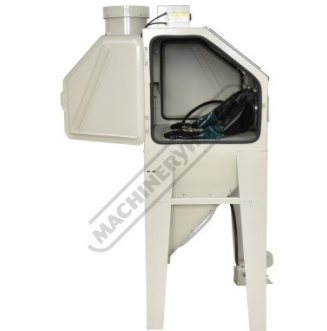
Left Side View Side Door Open