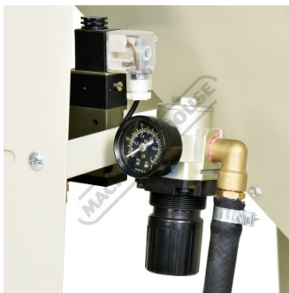
Air Pressure Gauge Assembly