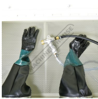
Gloves Top View