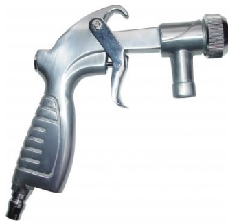
6SC0042 SANDBLASTING GUN