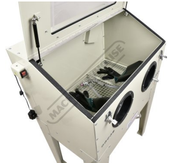
Hopper with Removable Grates