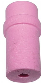
6SC0061 NOZZLES 6.0MM PKT 2