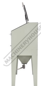
Side View Lid Open