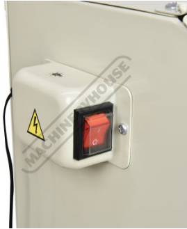
Switches for Light and Dust Collector