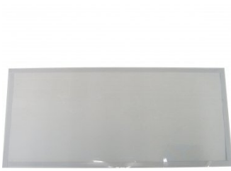
SC004 PVC SHEET PKT 5