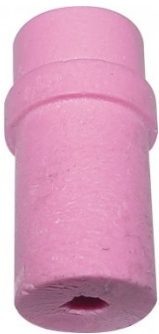
6SC0062 NOZZLES 7.0MM PKT 2