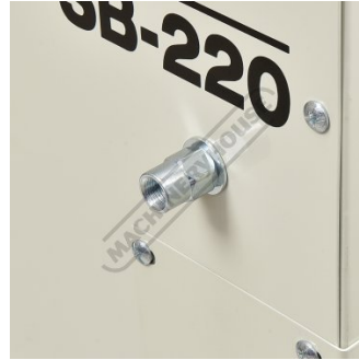
Compressed Air Inlet Connection