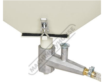
Abrasive Measuring Valve