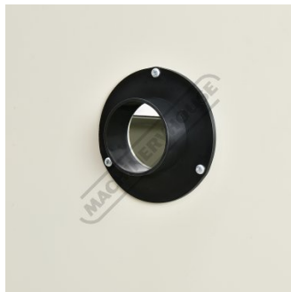
Dust Collector 63mm Outlet