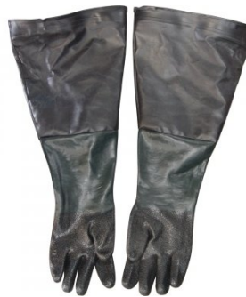
2SC0035 GLOVES PAIR