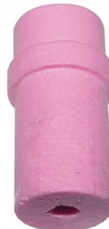
6SC0059 NOZZLES 4.5MM PKT 2