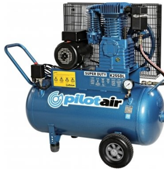
C511 Pilot Super Duty Air Compressor