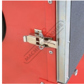
Latch Lock to Side Door