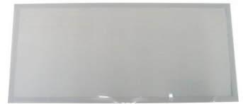
SC004 PVC SHEET PKT 5