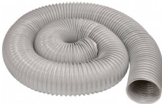
W398 PVC Dust Hose (Sold Per Metre)