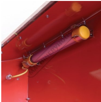
Internal Low Voltage Light