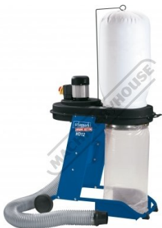
Recommended To Be Use With A Dust Collector