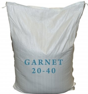
S295 Sandblasting Beads - Garnet