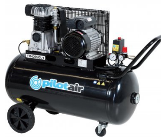
C5051 Pilot Air Compressor