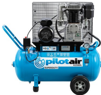
C511 Pilot Super Duty Air Compressor