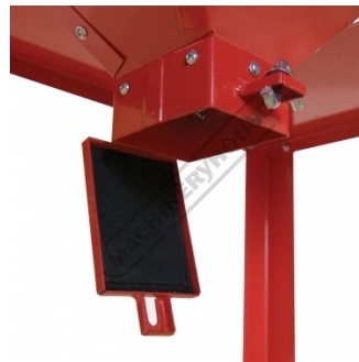
Bottom Release Trap