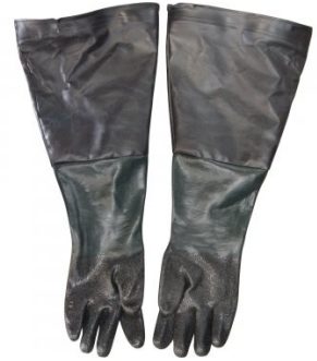
2SC0035 GLOVES PAIR