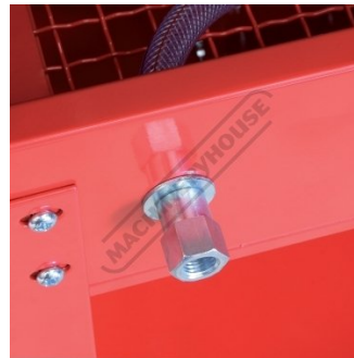
Fitting for Compressed Air Inlet