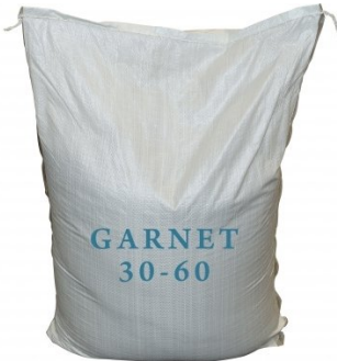
S296 Sandblasting Beads - Garnet