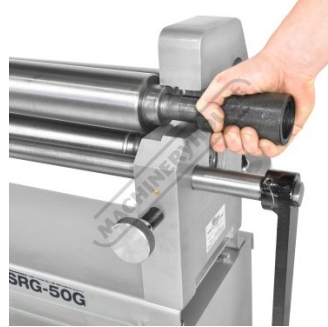
Removable top Roll