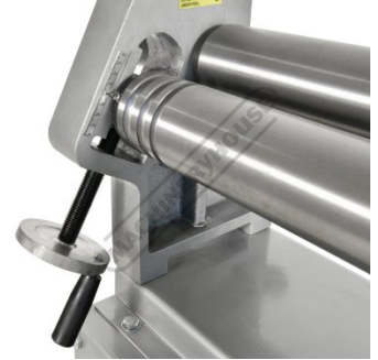
Rear Roll Height Adjustment And Roll Grooves