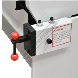
Quick Head Adjustment Handle for Material Thickness