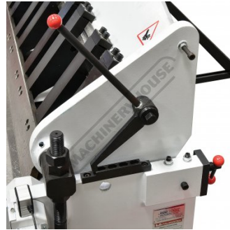
Top Beam Support Stop Lever and Thickness Adjustment Handle