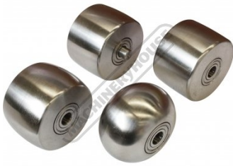
Included Dies 26, 80, 180, 300mm