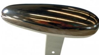
S2236 Oval Steel Dolly