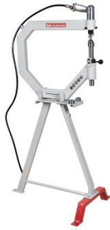
S227A Pneumatic Planishing Hammer