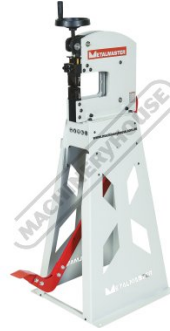
Right Angle View