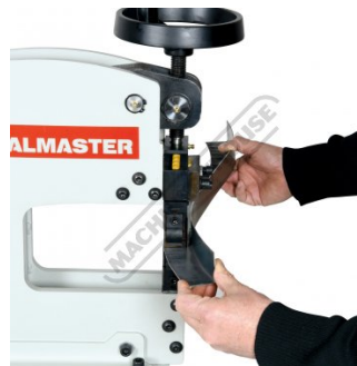
Stretching Dies In Action 2mm Mild Steel