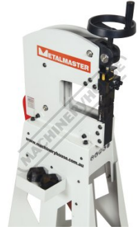
Head Top View