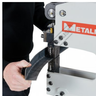
Stretching Dies In Action 2mm Mild Steel