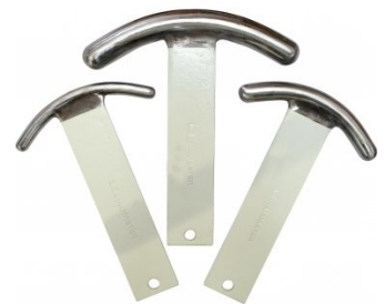
S2233 Curved Steel Dolly Set - 3 Piece