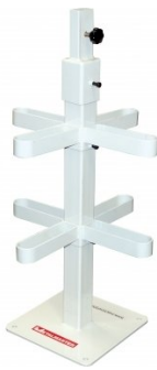
S2238 Steel Dolly Stand