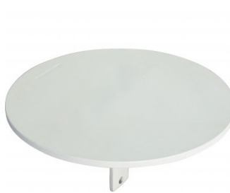
S2240 Round Steel Table for Sand Bag