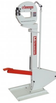
S2266 Foot Operated Shrinker Stretcher - Heavy Duty