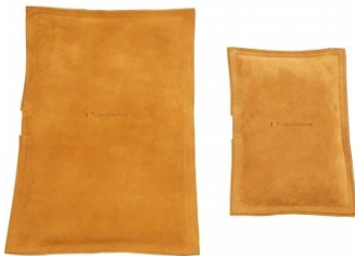
S212 Rectangle Leather Bags - Sand Filled