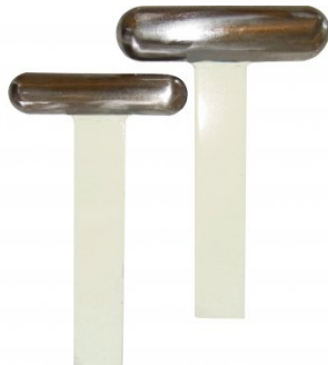
S2231 Straight Steel T-Dolly Set Large - 2 Piece