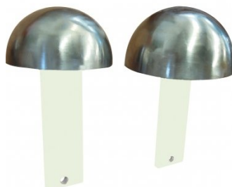
S2235 Mushroom Steel Dome Dolly Set - 2 Piece