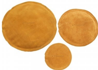
S210 Round Leather Bags - Sand Filled