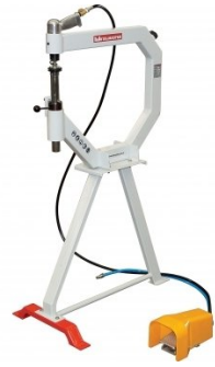
S227A Pneumatic Planishing Hammer