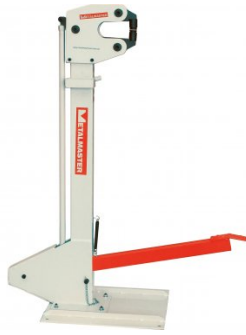
S2264 Foot Operated Shrinker Stretcher - Oval Jaws