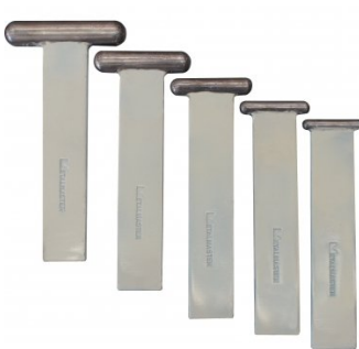
S223 Straight Steel T-Dolly Set Small - 5 Piece