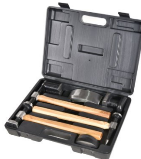
H885 Auto Panel Restoration Kit - DIY