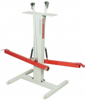
S2263 Shrinker Stretcher Foot Operated Stand