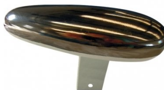
S2236 Oval Steel Dolly