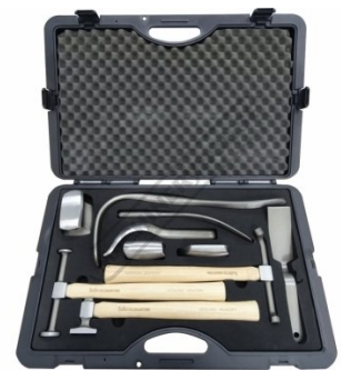
H887 Auto Panel Restoration Kit - Master