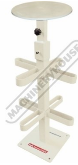
Shown with Optional Stand S2238