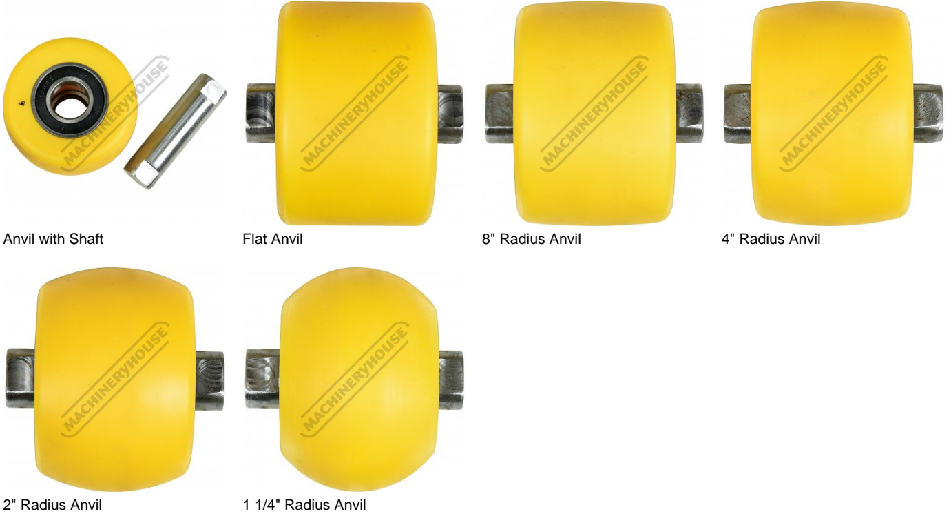
Anvil with Shaft