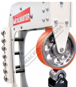
Shown Fitted On Wheel