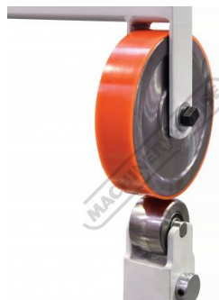
50 8mm Wide