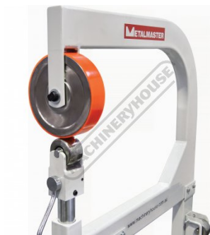
Shown Fitted To Wheel