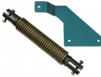
S099A Return Spring Conversion Kit