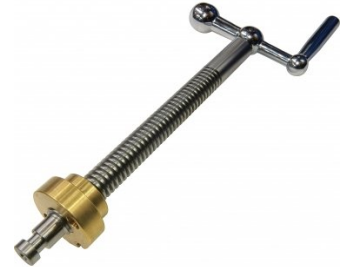
S094 Leadscrew Handle / Nut Assembly