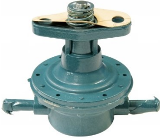
S098A Coolant Pump