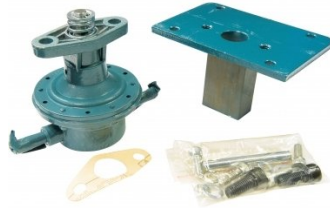
S098B Coolant Pump & Conversion Kit