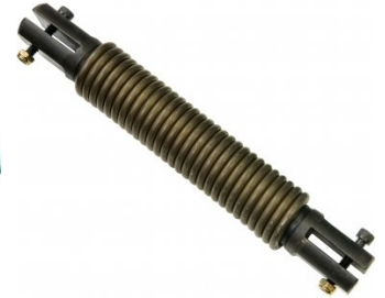
S099B Return Spring