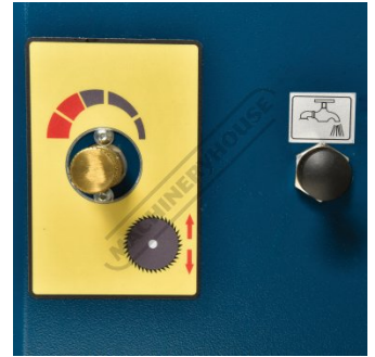
Blade Speed Control