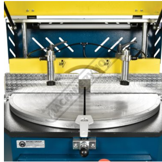
Pneumatic Clamps-Work Surface