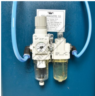
Air Regulator & Oiler