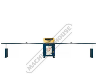
Attachable 2 x 3m Feed Roller Conveyors