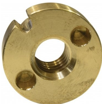
S096 Vice Nut - Brass Type