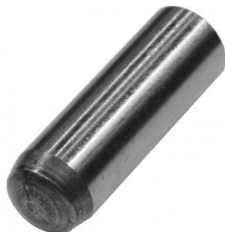
S095 Dowel Pin