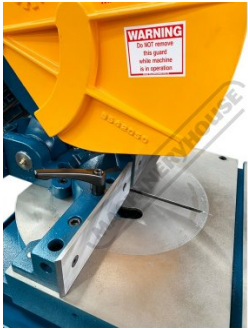
G Model Clamping