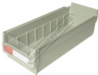
Shown Without Dividers