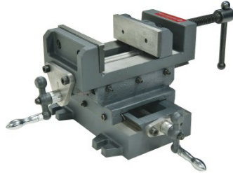
V1205 Compound Drill Vice