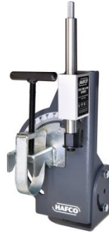
P090 Pipe & Tube Notcher Attachment