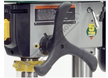
Cast Iron Handwheel