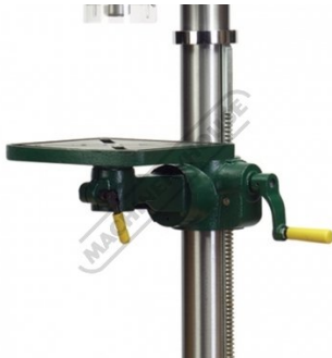
Rack and Pinion Rise and Fall