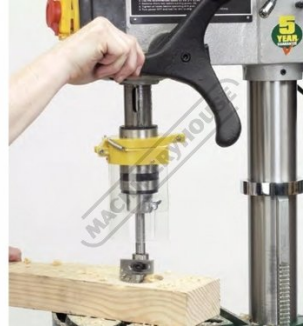
Powerful Induction Motor