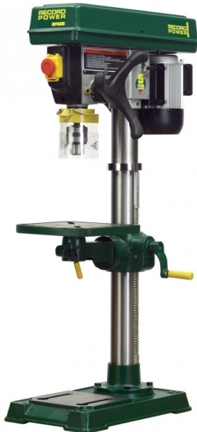
Table Tilts Left & Right To 45° & Rotates Ø16mm Drill Capacity with 2MT Spindle Taper