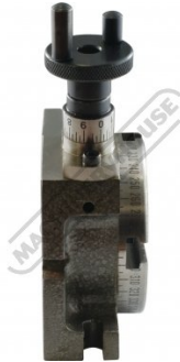
Side View on Edge