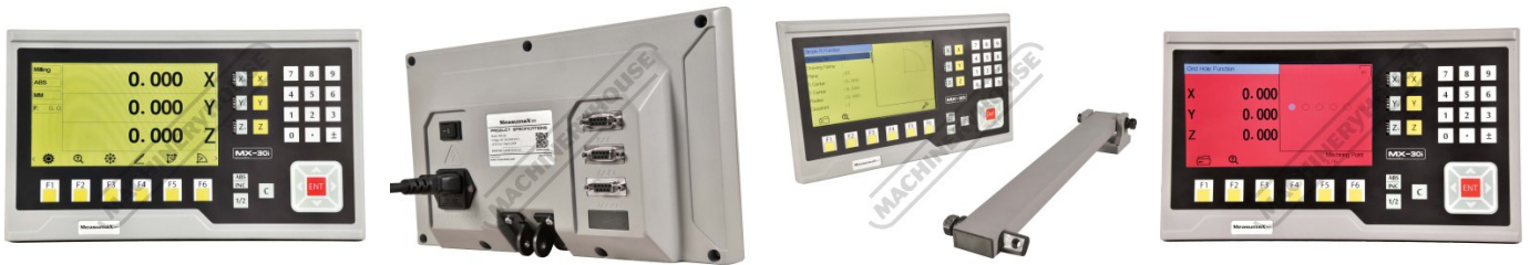
Multiple pre set display colours