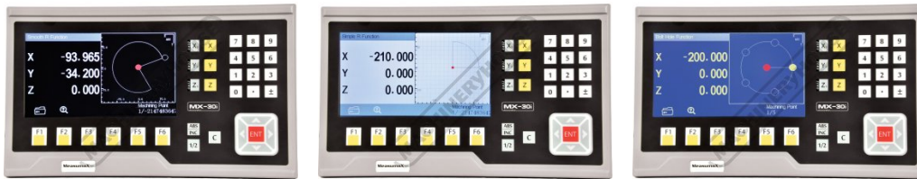
Smooth Radius Function