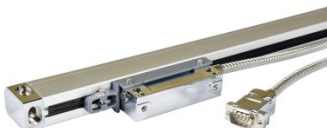
Q8526 420mm Digital Readout Scale