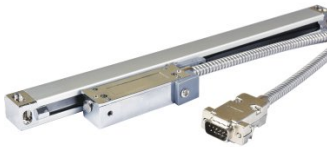
Q8512 220mm Digital Readout Scale