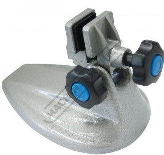
Front Angle View