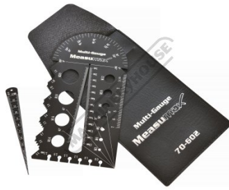
Includes Protective Pouch